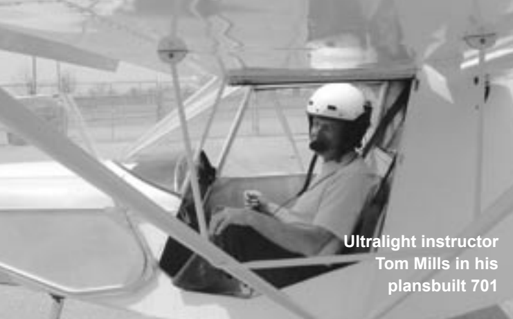
Ultralight instructor Tom Mills in his plansbuilt 701

This is a plane for flying a couple of hours to a fly-in, for landing on a riverbank to fish, or on a farm driveway to visit friends